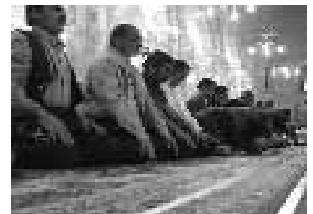
Muslim men at prayer in The Power of Forgiveness

More information is available at www.thepowerofforgiveness.com .