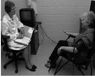
Lawler Row with patient

Highly forgiving people have lower blood pressure just walking around in the world every day. Forgiving people seem to take better care of themselves. They are less likely to smoke, less likely to drive unsafely, and that has an impact on health.