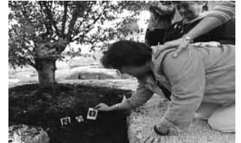
9/11 family member places prayer card in Beirut forgiveness garden